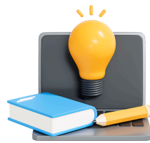
TCF Canada Exam Prep Resources