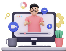
French Grammar Revision

Access French Grammar Revision materials to establish a solid foundation, engage in practice with TCF Canada Exam Simulations, and utilize organized Exam Prep Resources for efficient learning. Additionally, take advantage of personalized One-on-One Feedback Sessions to enhance your confidence.